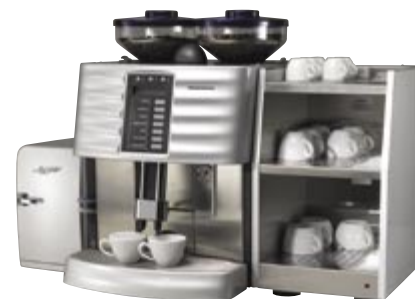
WITH FRIDGE & CUP WARMER

For those who like to froth milk by hand, the Coffee Art power steam model provides copious amounts of steam to allow barista style service. With separate boilers, one for the coffee production and one for the steam production, the Coffee Art is capable of keeping up with the task at hand without sudden loss of temperature.