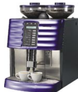
COFFEE ART BLUE

Cleaning and maintenance of the Coffee Art is made simple with the automatic cleaning cycles which are easy to follow with on screen prompts. The display will tell you when the grounds container needs emptying, when cleaning is required or beans need replenishing. There are also many optional extras to suit your business, including; undercounter container for coffee grounds, standard accounting systems, coin validator, card system and self-service operation.