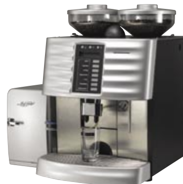
COFFEE ART & MILK FRIDGE

The Schaerer Coffee Art from Cafe Bar satisfies the high demands of today's coffee consumer. Each cup is freshly ground from the bean automatically for maximum freshness and aroma. The brewing process ensures perfect coffee extraction whilst the advanced milk foaming system produces the ideal compact micro-bubble milk foam.