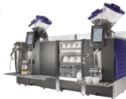
'BCL' WITH CUP WARMER & 'C'

When you select your drink by touching the illuminated screen, you really get a sense of the brilliant Swiss technology and engineering which makes this extraordinary machine. With many set up options, from the slimline Celebration 'C'